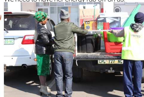
Staff loading one of the cars with ROTO goodies