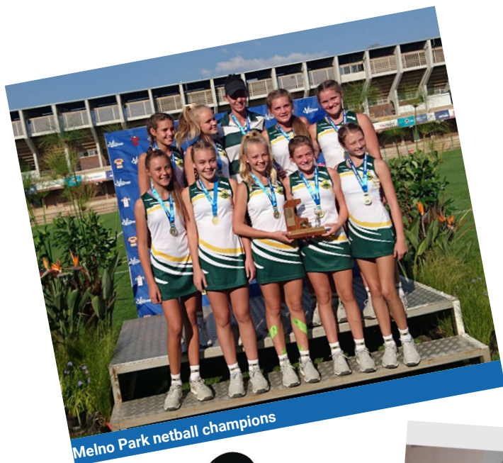
Melno Park netball champions