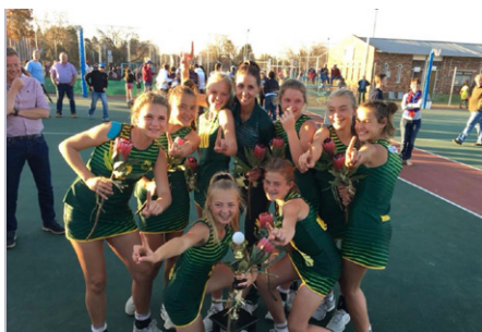
2018 SA Winners