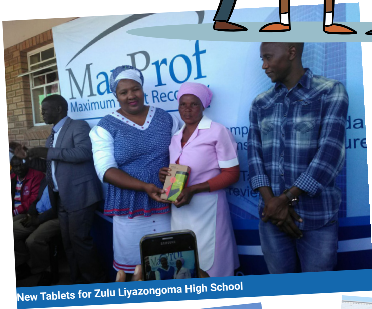
New Tablets for Zulu Liyazongoma High School