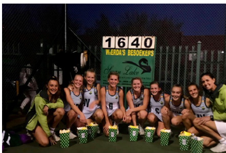
2018 Liga Winners Menlo Park

If you have been following this team's success, you will recall that Menlo Park Primary School's First Netball Team, sponsored by MaxProf, has won many games and tournaments in 2018, including the Super 12 Primary School Tournament which was held at TUKS on 18 April, the highly prestigious Wildecklawer Invitational Tournament which was held at Kimberley from 27 to 30 April, and most recently the South African Championships , Bloemfontein, during the weekend of 27 July.