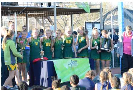
2018 SA Winners Menlo Park Primary School