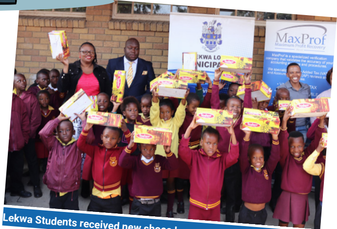
Lekwa Students received new shoes !