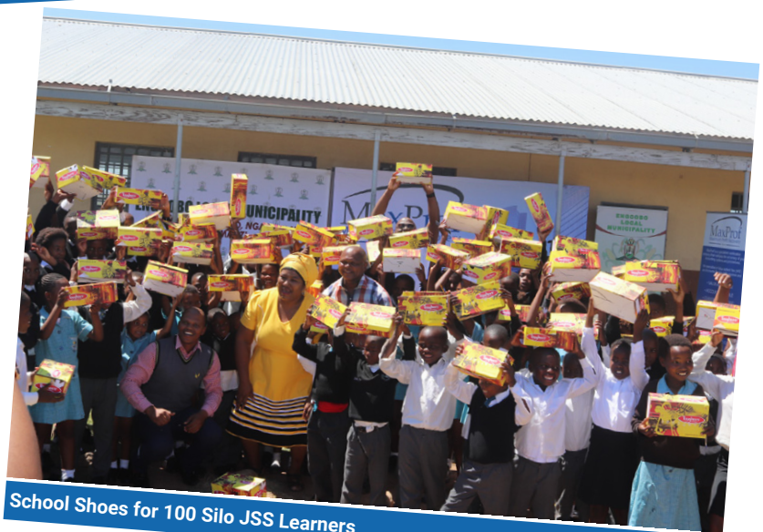
School Shoes for 100 Silo JSS Learners