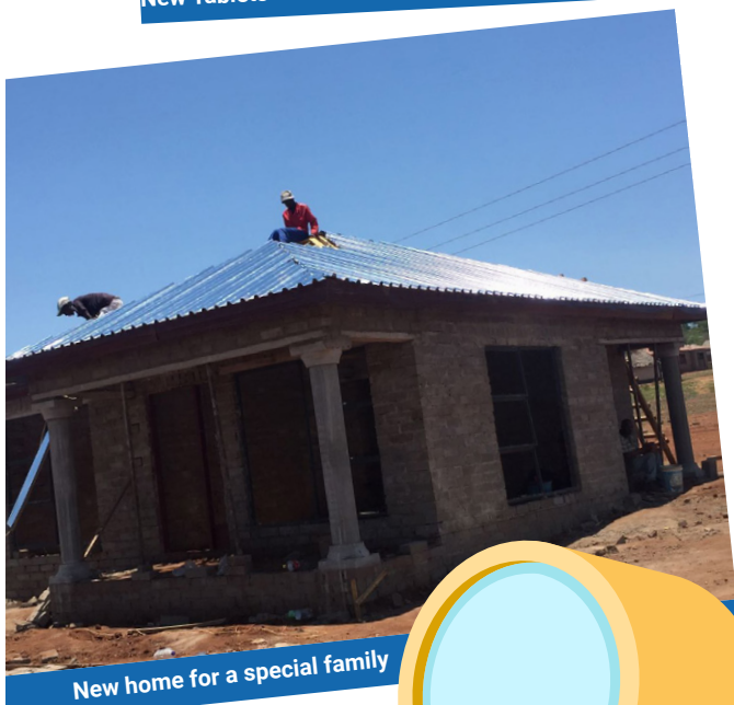
New home for a special family