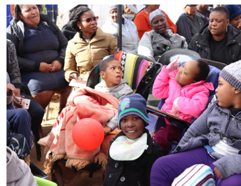
They may not understand what is happening but they could feel the love