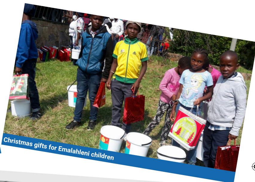
Christmas gifts for Emalahleni children