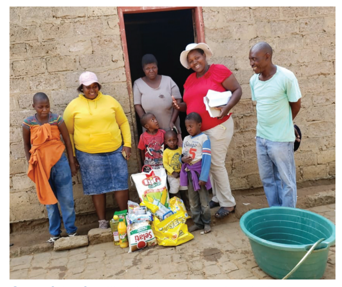
One of the families happy to receive their hampers

has received R 20,000 for food parcels and other necessities. The list goes on, including R 30,200 for Lepelle-Nkumpi's food parcels, sanitizers and toiletries; we are still working tirelessly with other municipalities to help those communities affected by this pandemic.