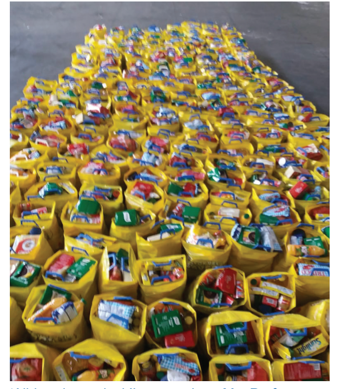
'All-hands-on-deck!' approach as MaxProf partners with various municipalities to tackle the COVID-19 pandemic

"The Coronavirus pandemic is the defining global health crisis of our time and the greatest challenge we have faced since World War Two."