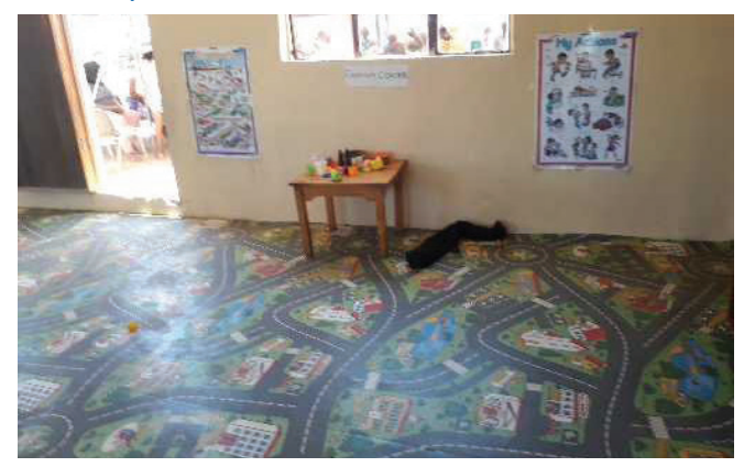
New Carpet donated by MaxProf