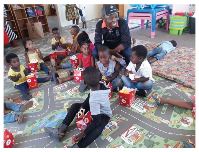
Young ones enjoying their special treats

Tables for the creche, chairs, books, educational toys, a fridge, stove, cooker plug, microwave oven, a kitchen unit, burglar proofing material, paint, brushes and labor, surface vinyl flooring, grocery hampers and lunch packs for the elderly, as well as educational toys, party packs and a lunch pack, are amongst the items sponsored by MaxProf.