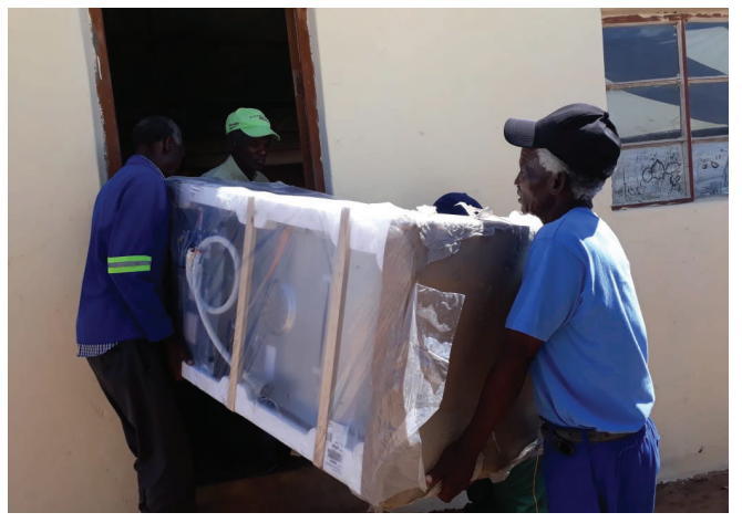
New Fridge donated by MaxProf