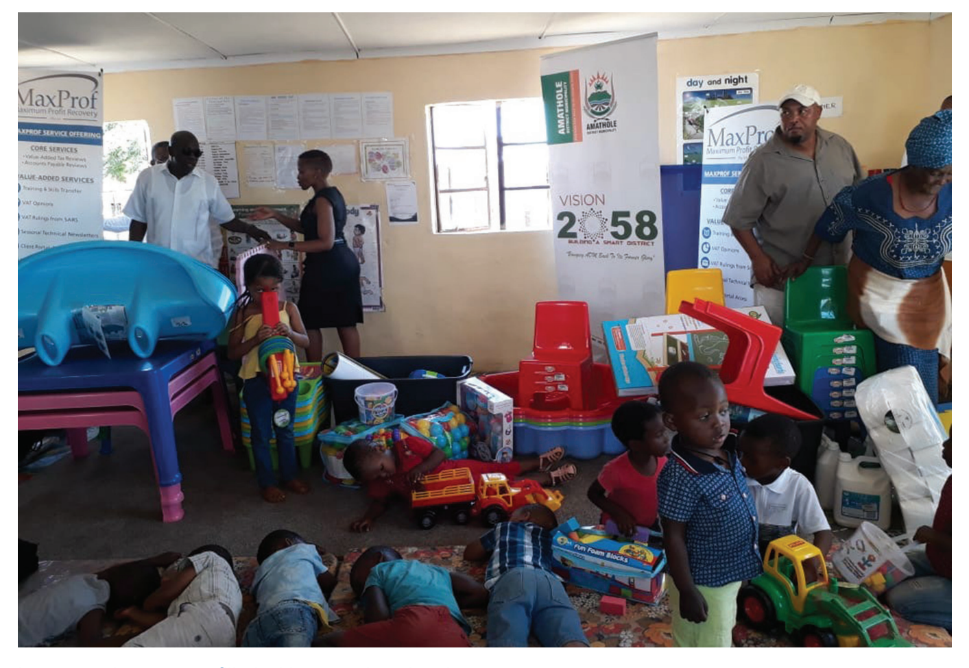
Learners classroom refilled with new educational toys