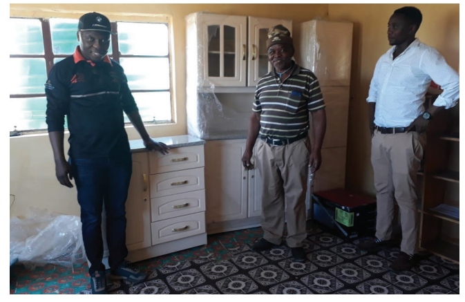
New Kitchen Unit donated by MaxProf