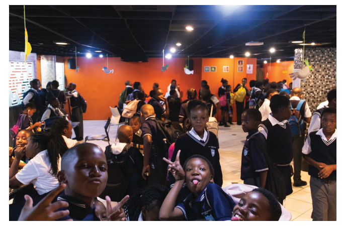
Snack and fun time was part of the programme for the day for all learners