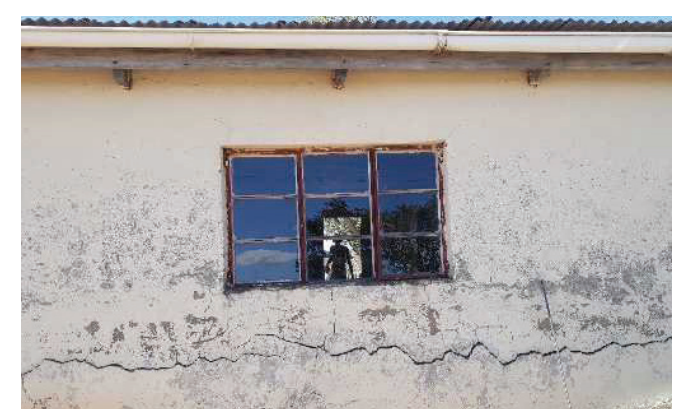
Masivuye Educare Centre Wall to be plastered