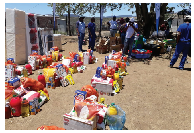
Appliances, educational toys and hampers for Masivuye Educare