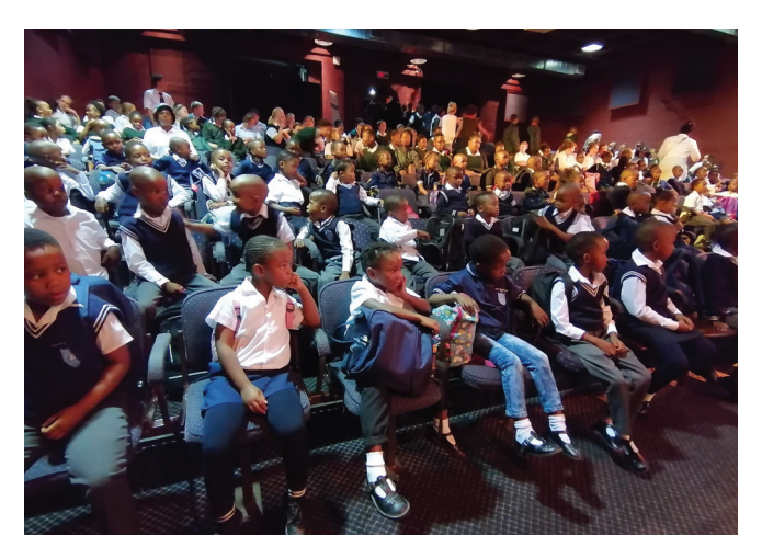
Learners filled up The South African State Theatre to learn through Arts

Without The South African State Theatre working with the Department of Education and the respective schools, none of this would have been possible. The schools and institutions supported included Bethesda, Zodwa Special School, Magalies Special School, Prospectus Novus, Alma Special School, Sunrise Special School, Little Gems, Itireleng Residential Care for the disabled and Mozart Academy.