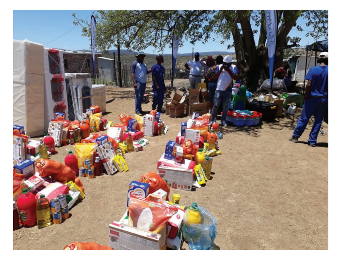
Appliances, educational toys and hampers for Masivuye Educare

He continued by telling the community that the gifts to the elderly are a reminder that we are aware that the teachers and caregivers are also parents to these children and that these gifts are also aimed at bringing dignity back to the people.