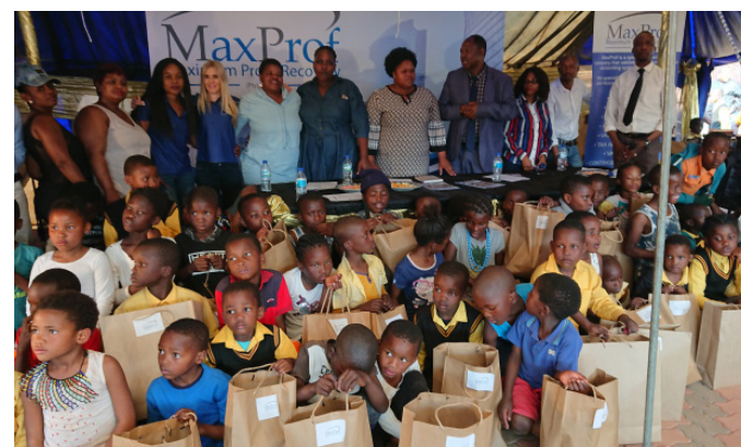
Mavula Primary Learners with their school uniforms