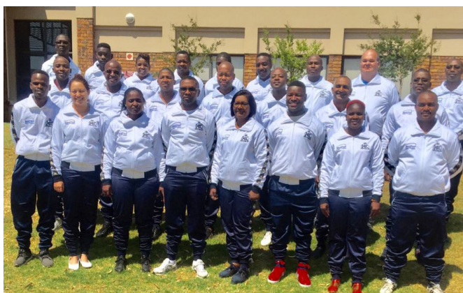
Mpumalanga SAPS Band showing-off their newly sponsored tracksuits