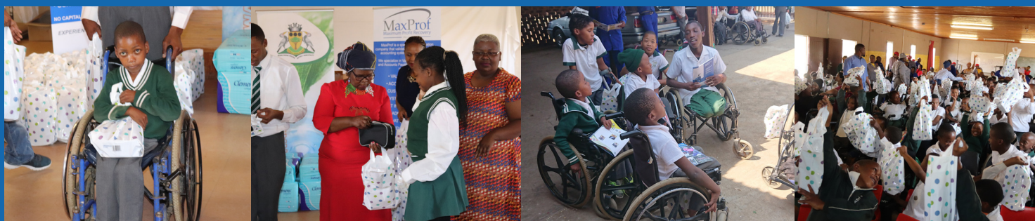
Tlamelang Special School Celebrating MaxProf's Sponsorship