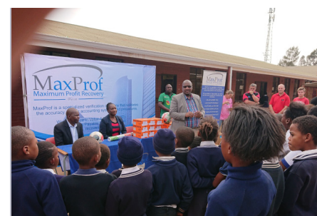
Seatile Learners listening to Rand West City First Citizen, Mayor Mzi Khumalo