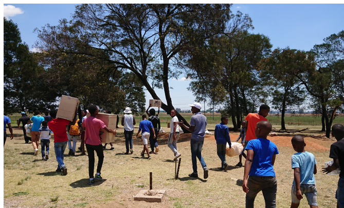
Rainbows United Football team helping MaxProf off-load the sponsored items