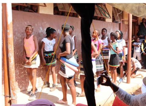
Learners performing for the audience