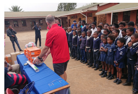
Venterspost Primary School, it is your turn to walk towards the future