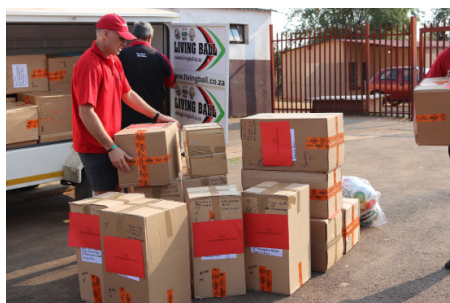
First Stop was Western Areas Intermediate School

recreational skate boarding; the municipality shaving down the slopes to avoid accidents.