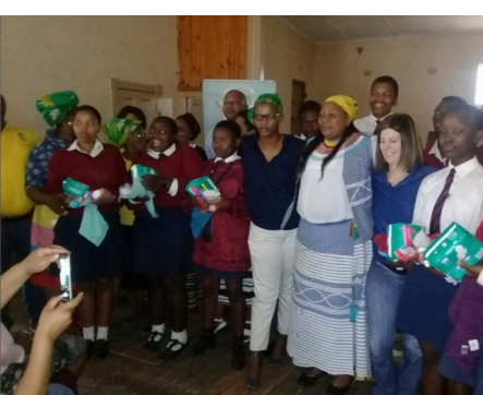
Willowvale community celebrating a beautiful busy day