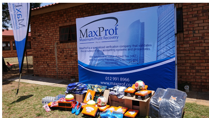
MaxProf donates soccer kits and equipment to the youth of Victor Khanye Municipality

Upon our arrival we told the teams what were in the boxes and they could not hold their excitement; they could not wait for the Mayor to finalise the official opening, ripped open the boxes in excitement and