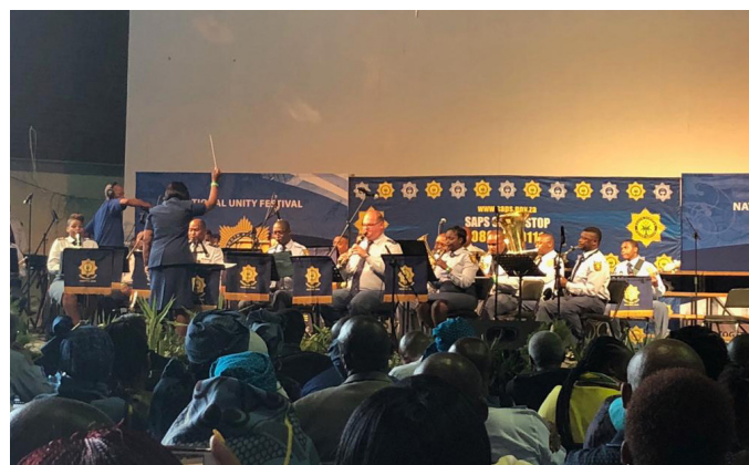
Band performing their Prescribed Piece