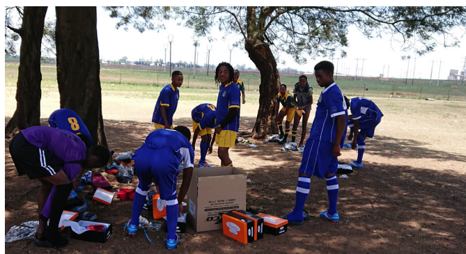
Rainbows United Football team changing into the new kit