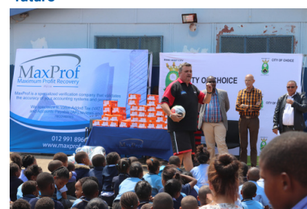
Toekomsrus Primary School, wind or no wind, walk on