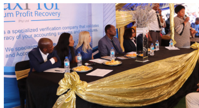
To every event, a purpose is important

Thank you again for supporting Mavula Primary school!"