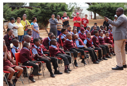
Mayor Mzi Khumalo addressing learners of Western Areas Intermediate School