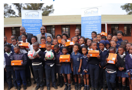
Seatile Primary School, here is to a bright future