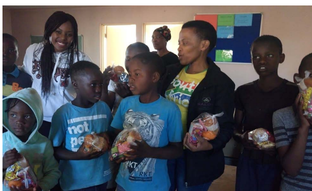
All the children received party-packs