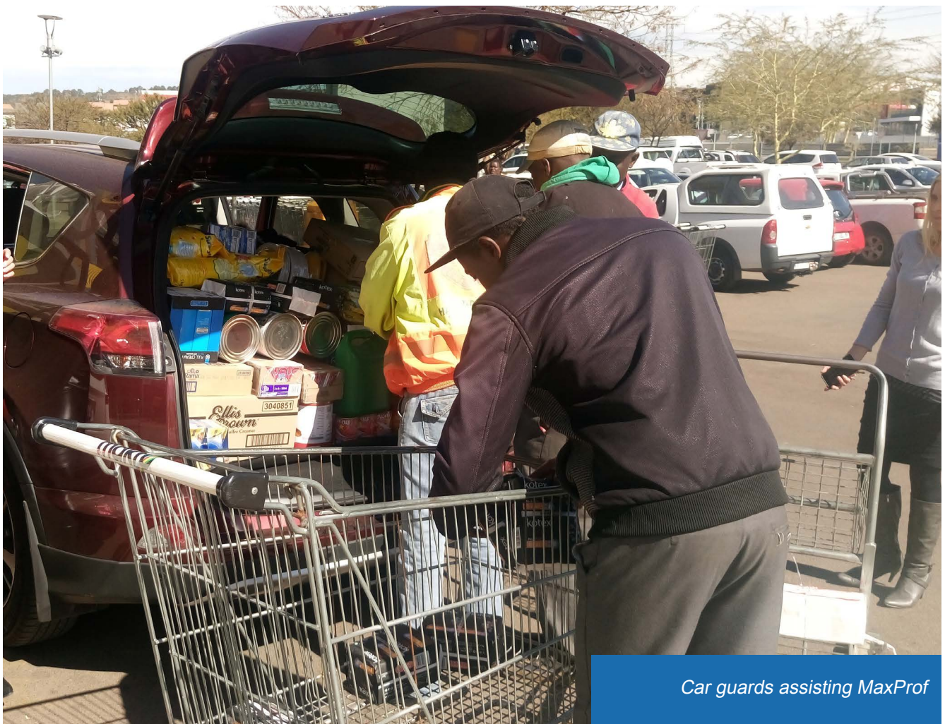
Car guards assisting MaxProf

Moloto Spar manager and some of his team arrived with goodies for the children and helped serve the meals. After the “serious activities”, MaxProf then took time to spend some quality time with the children. The atmosphere was beautiful with the community joining in the festivities. MaxProf donated groceries and toiletries to the Centre, as per the wish-list received from the Centre outlining their needs.