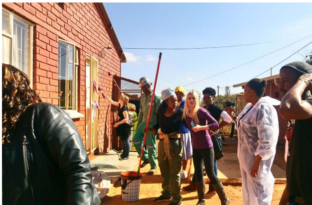
The MaxProf team busy painting the centre

MaxProf's team arrived at the Centre in the morning where everyone gathered for introductions, honouring Madiba, explaining to the children the significance of the day and singing of the National Anthem followed by a prayer. Immediately after that, the team divided into different groups which consisted of "the cleaning up and painting group", "the braai masters" and "the kitchen team" that handled the preparation of the breakfast and lunch to be served to the children of the Centre. For some of us, this was a super experience, as it was the first time that we had to cook for more than 100 people.