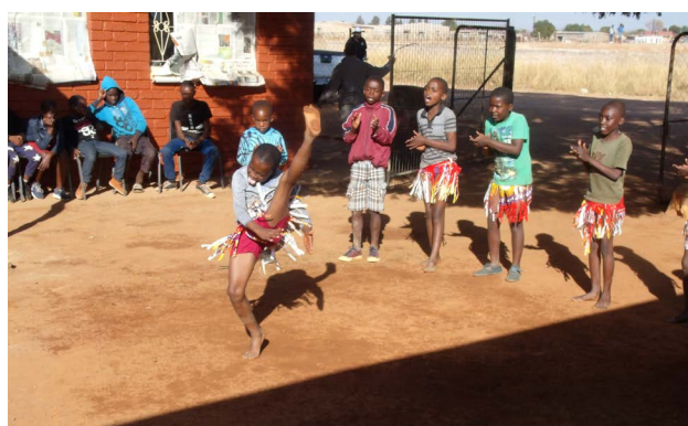
When all had been said and done, it was time for some entertainment. The children from the centre showed us their talents by singing traditional songs and dancing to traditional music.