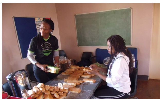
You cannot work on an empty stomach, right ? MaxProf's Maachela and Toka busy with lunch preparations